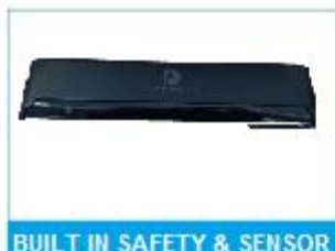
BUILT IN SAFETY & SENSOR